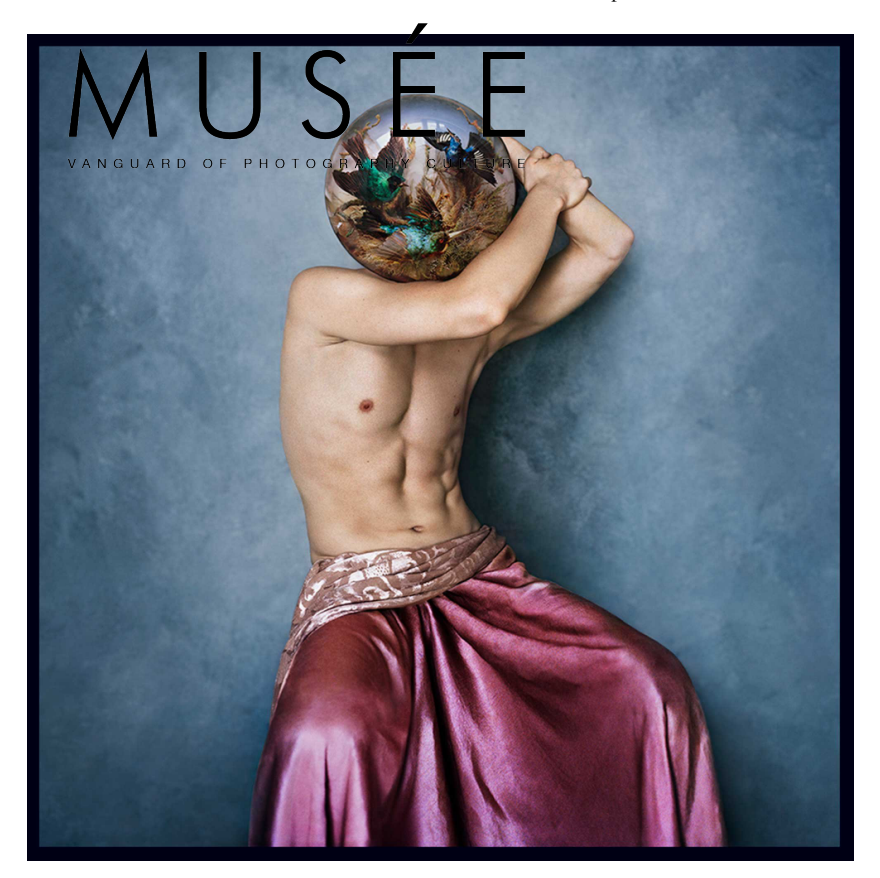
Vee Speers Transcendence, Globe, 2023

The powerful images are covered in deep colors and ethereal tints. Fantastic, as well as natural elements, such as animals, flowers or plants are placed around the subject, further emphasizing a theatrical and romantic feeling, sometimes immersing the viewer in an enchanting world where there is a narrative for each photograph. Created by Speers for her shoots, clothing also plays an important role in each image, serving as a symbolic element that places the character in a specific context and setting, and conveying messages and emotions. The characters are driven by different human emotions, portraying the beauty found in imperfect beings.