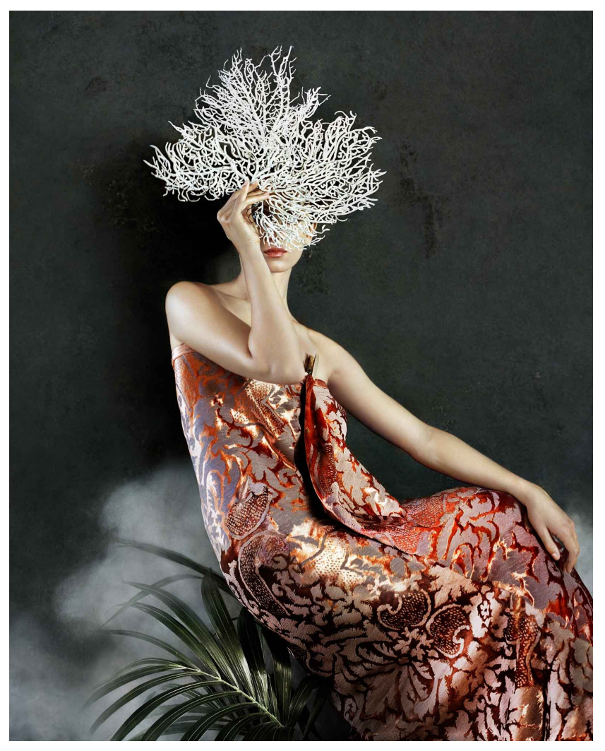
Vee Speers Phoenix, Untitled #1, 2020