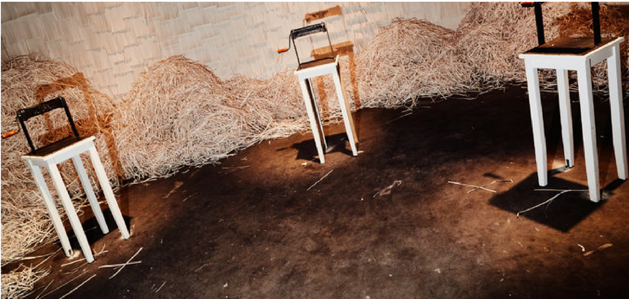
Jake Gyllenhaal's room inside the pop-up installation.